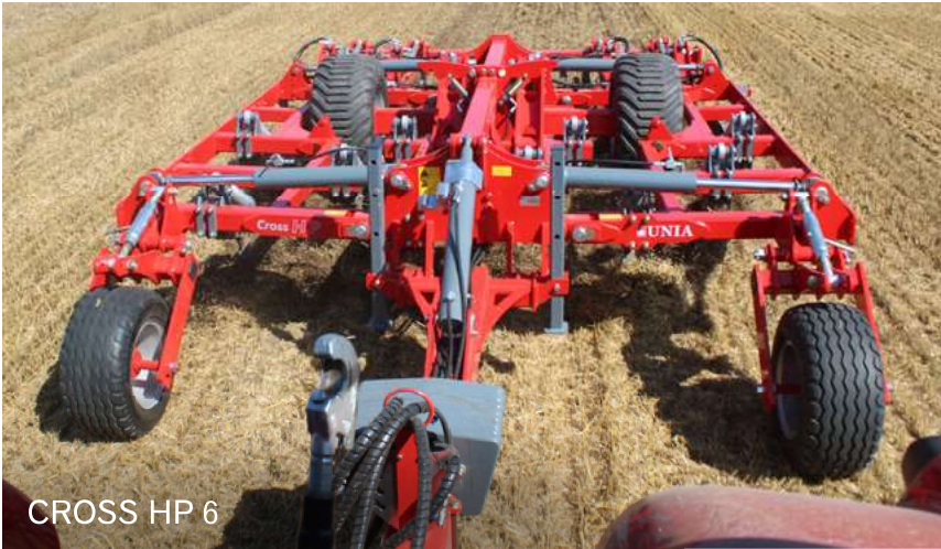
CROSS HP 6