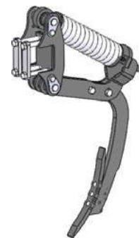
Tine with narrow coulter